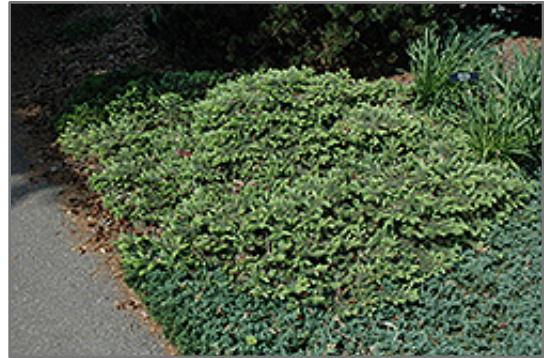
Mesa Verde Spruce