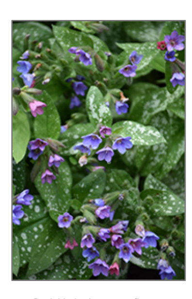
Dark Vader Lungwort flowers