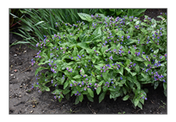
Dark Vader Lungwort in bloom