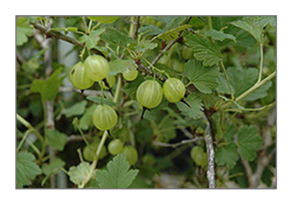
Hinnonmaki Yellow Gooseberry fruit

An improved variety of gooseberry for the home orchard with large golden-yellow fruit with sweet flesh and a tangy outer skin, increased resistance to powdery mildew and exceptional yields; very thorny, needs regular pruning for productivity