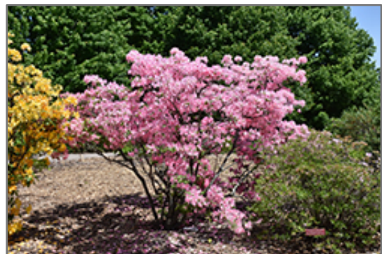
Northern Lights Azalea in bloom