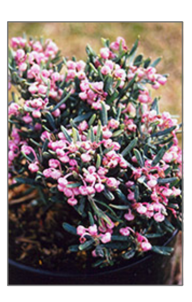
Bog Rosemary flowers

Bog Rosemary features dainty nodding white bell-shaped flowers with shell pink overtones at the ends of the branches from mid to late spring. It has bluish-green evergreen foliage. The needles remain bluish-green throughout the winter.