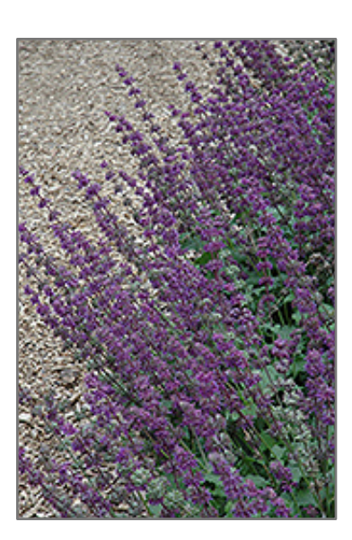
Purple Rain Salvia in bloom

An erect perennial variety featuring arched, whorled spikes of two-lipped violet-purple flowers throughout summer; tolerates drought once established; best in poorer soils; deadhead to extend flowering; perfect for borders, rock gardens, or naturalizing