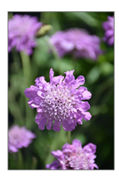
Pink Mist Pincushion Flower flowers

Pink Mist Pincushion Flower features unusual lavender pincushion flowers at the ends of the stems from late spring to early fall. The flowers are excellent for cutting. Its deeply cut ferny leaves remain grayish green in colour throughout the season.