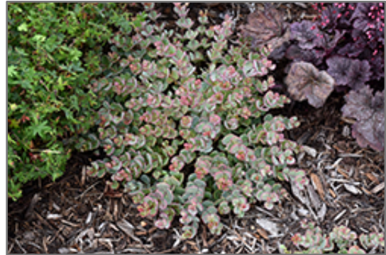
October Daphne

October Daphne is recommended for the following landscape applications;