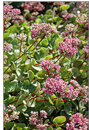
October Daphne flowers