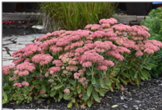
Autumn Fire Stonecrop in bloom

Autumn Fire Stonecrop is recommended for the following landscape applications;