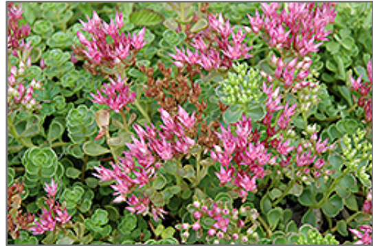
John Creech Stonecrop flowers

John Creech Stonecrop is recommended for the following landscape applications;