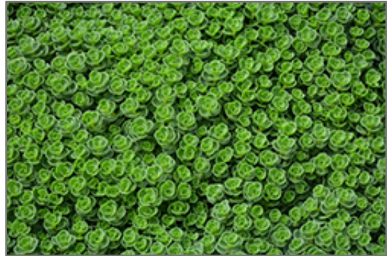
John Creech Stonecrop foliage

John Creech Stonecrop will grow to be only 3 inches tall at maturity, with a spread of 12 inches. When grown in masses or used as a bedding plant, individual plants should be spaced approximately 10 inches apart. Its foliage tends to remain low and dense right to the ground. It grows at a fast rate, and under ideal conditions can be expected to live for approximately 10 years. As an herbaceous perennial, this plant will usually die back to the crown each winter, and will regrow from the base each spring. Be careful not to disturb the crown in late winter when it may not be readily seen!