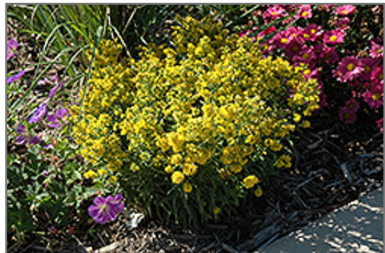
Goldrush Goldenrod in bloom