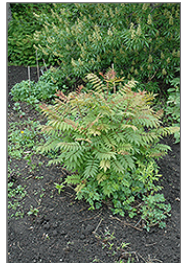
Sem False Spirea