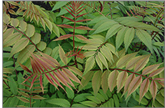
Sem False Spirea foliage

This shrub will require occasional maintenance and upkeep, and is best pruned in late winter once the threat of extreme cold has passed. Gardeners should be aware of the following characteristic(s) that may warrant special consideration;