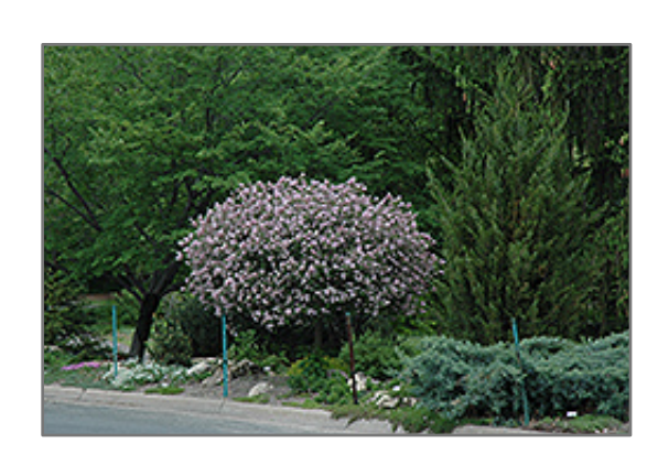
Dwarf Korean Lilac (tree form) in bloom

A beautiful and popular patio shrub with numerous attributes; striking spikes of fragrant lilac-pink flowers in late spring, small rounded foliage and a uniform compact ball shape grafted onto a standard, best used as a solitary accent in the garden