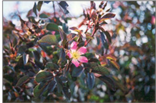
Red Leaf Rose flowers

This is a high maintenance shrub that will require regular care and upkeep, and is best pruned in late winter once the threat of extreme cold has passed. It is a good choice for attracting bees to your yard. Gardeners should be aware of the following characteristic(s) that may warrant special consideration;