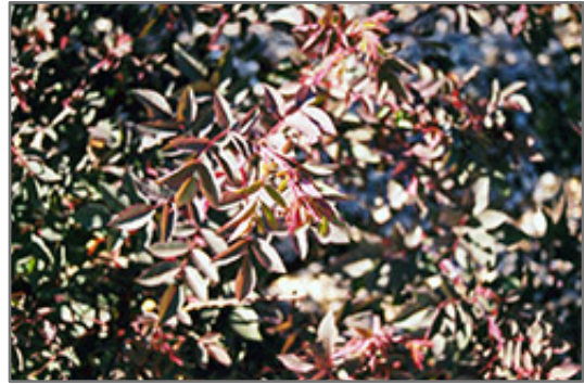
Red Leaf Rose foliage

This shrub should only be grown in full sunlight. It does best in average to evenly moist conditions, but will not tolerate standing water. It is not particular as to soil type or pH. It is highly tolerant of urban pollution and will even thrive in inner city environments. This species is not originally from North America.