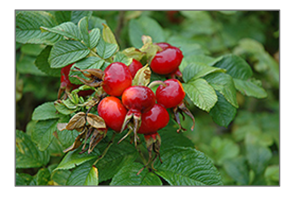
Rugosa Rose fruit

This shrub should only be grown in full sunlight. It does best in average to evenly moist conditions, but will not tolerate standing water. It is not particular as to soil type or pH, and is able to handle environmental salt. It is highly tolerant of urban pollution and will even thrive in inner city environments. This species is not originally from North America.