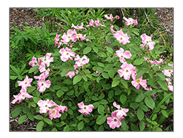
Rugosa Rose in bloom