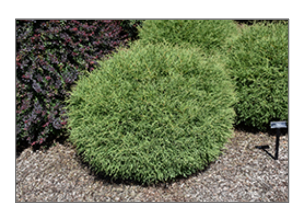
Mr. Bowling Ball Arborvitae

This tiny shrub just demands to be loved by all gardeners, with very unusual threadlike sage-green foliage and an extremely dwarf, compact form that requires no pruning to maintain its perfectly rounded shape; ideal for rock gardens and detail use