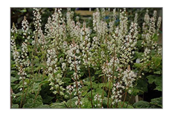
Wherry's Foamflower flowers