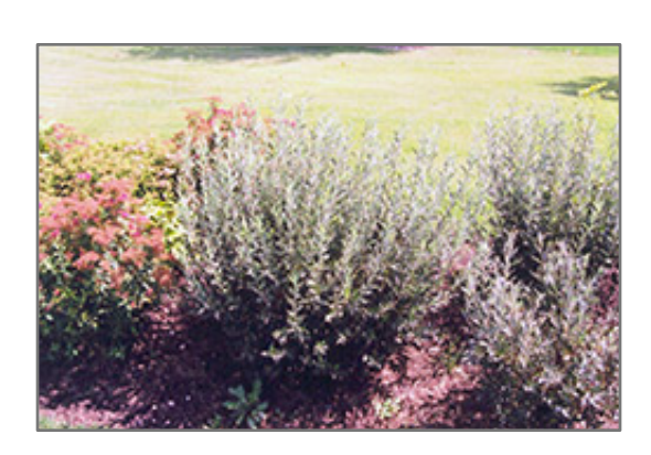
Blue Fox Willow

A very attractive upright rounded shrub with fine, silvery-blue foliage all season long; extremely hardy, controlled compact habit of growth, takes pruning well; great for form, texture and color in the garden