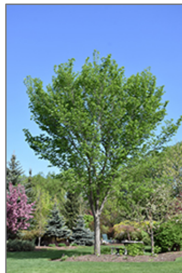
Brandon Elm