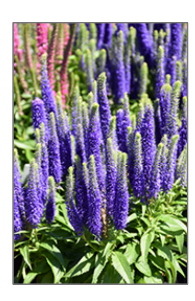
Royal Candles Speedwell flowers