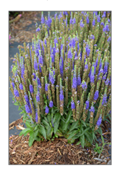
Royal Candles Speedwell in bloom