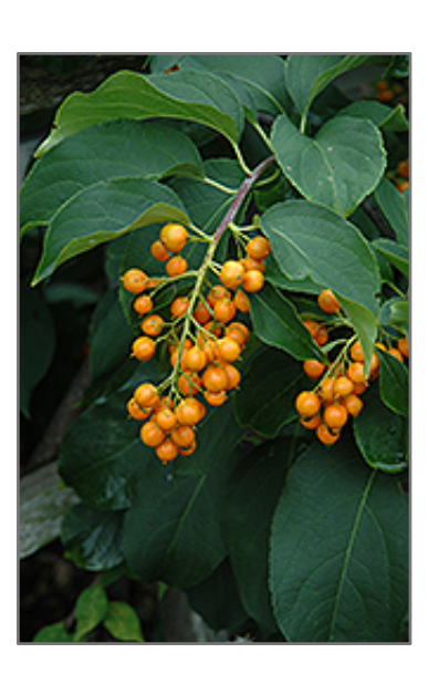
Hercules And Diane Bittersweet fruit

Hercules And Diane Bittersweet is primarily grown for its highly ornamental fruit. It features an abundance of magnificent orange berries in mid fall. It has dark green deciduous foliage. The round leaves turn yellow in fall.