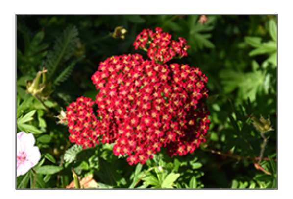
Red Velvet Yarrow flowers

An outstanding yarrow from the Netherlands, this hardy plant has dark rosy red flowers that refuse to fade; prefers to be planted in infertile soil and perfect for xeriscapes