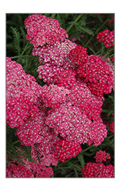
Saucy Seduction Yarrow flowers

Saucy Seduction Yarrow features showy rose flat-top flowers at the ends of the stems from early to late summer. The flowers are excellent for cutting. Its attractive tomentose ferny leaves remain grayish green in colour throughout the season.