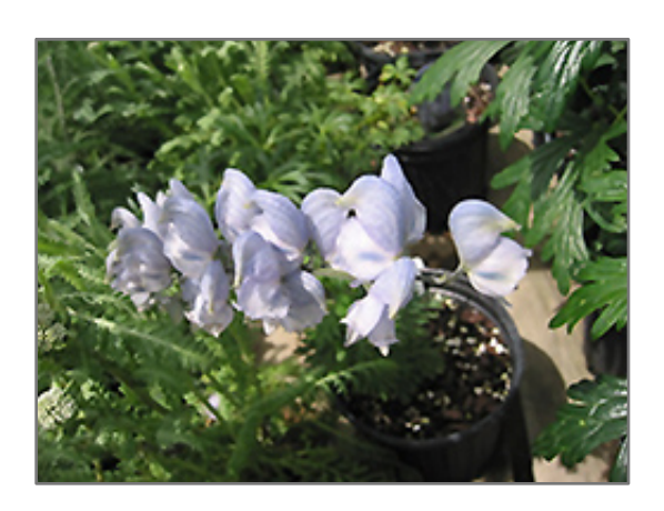
Stainless Steel Monkshood flowers

This showy perennial is popular for its remarkable metallic-blue spikes of flowers and attractive glossy green leaves; prefers to be planted in part-shade locations; Stainless Steel is compact and sturdy enough that it should not require staking