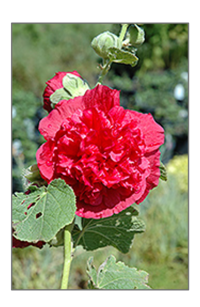
Chater's Double Rose Pink Hollyhock flowers