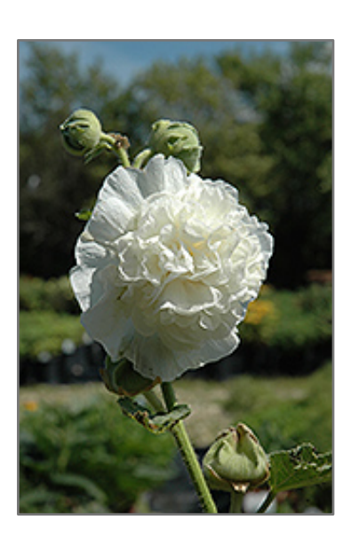
Chater's Double White Hollyhock flowers