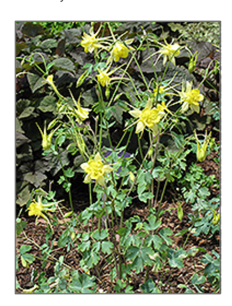
Yellow Queen Columbine in bloom

Yellow Queen Columbine is recommended for the following landscape applications;