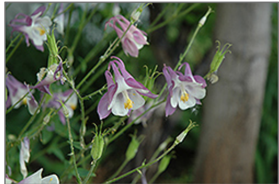
Common Columbine flowers

This is a relatively low maintenance plant, and should be cut back in late fall in preparation for winter. Deer don't particularly care for this plant and will usually leave it alone in favor of tastier treats. Gardeners should be aware of the following characteristic(s) that may warrant special consideration;