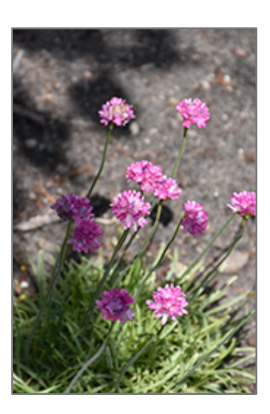
Nifty Thrifty Sea Thrift flowers

Unique tufts of grassy foliage with creamy white variegated foliage; showy globe-shaped pink flowers on wiry stems; this plant thrives in poor soils and xeriscapes