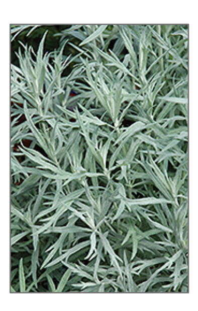
Silver Queen Artemisia foliage