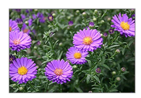
Days Aster flowers

Profusion of dark lavender-blue flowers and attractive lance-like green leaves; prefers cool, moist soil; water the root zone instead of from the top to reduce fungal disease; water regularly to encourage more blooms