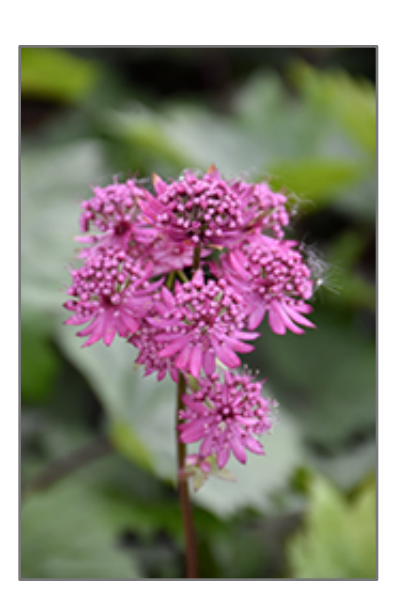
Star Of Beauty Masterwort flowers

Beautiful burgundy pincushion flowers on nearly-black stems with a glowing white center; great on streambanks or in a moist border, doesn't like to dry out; cut back after flowering for a second flush