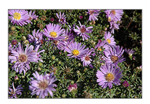
Woods Light Blue Aster flowers

Compact, mounding habit; profusion of powder blue flowers and attractive lance-like green leaves; prefers cool, moist soil; water the root zone instead of from the top to reduce fungal disease; water regularly to encourgage more blooms