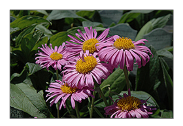
Pinkie Alpine Aster flowers

Carpet early blooming aster; profusion of deep pink flowers and attractive lance-like green leaves; prefers cool, moist soil; water the root zone instead of from the top to reduce fungal disease; water regularly to encourgage more blooms