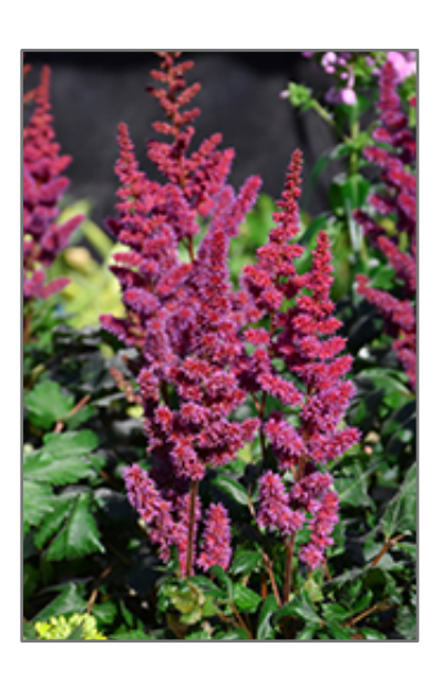
Visions in Red Chinese Astilbe flowers

Soft, showy dark purplish-red plumes, rising above glossy leaves; perfect in a shady spot with dappled light; prefers moisture so water regularly for abundant flowers and nice foliage