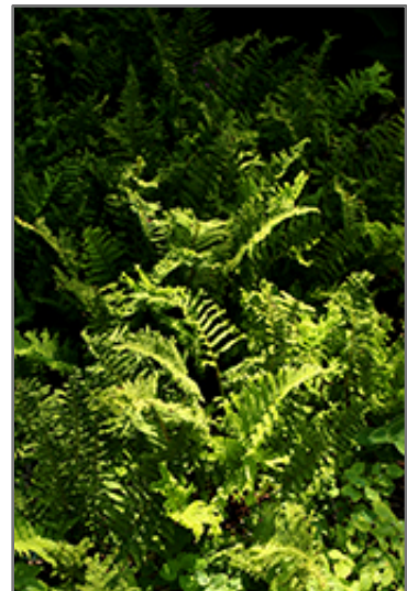
Lady Fern foliage