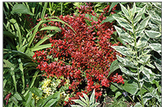
Cherry Bomb Japanese Barberry