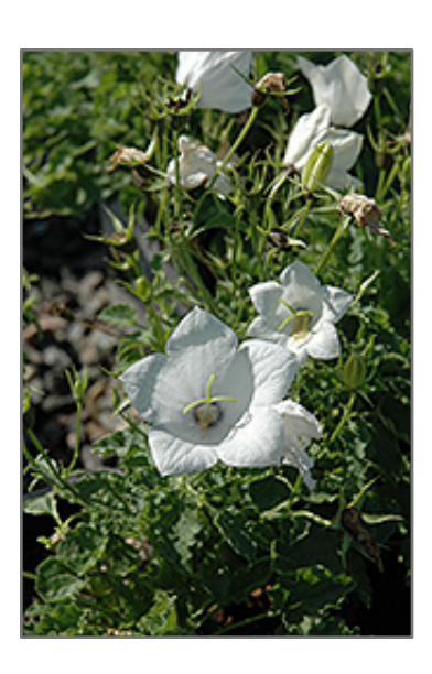
White Uniform Bellflower flowers