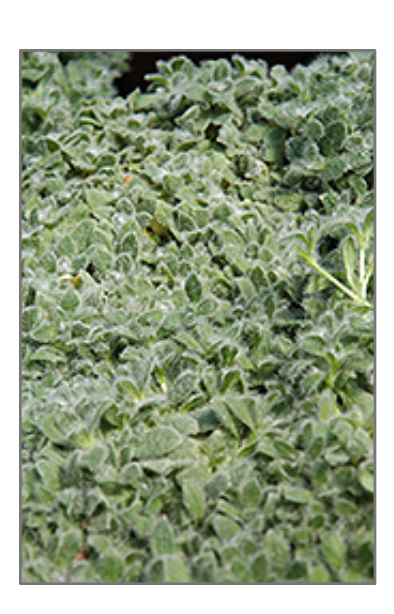
Alpine Mouse Ears foliage

Alpine Mouse Ears is blanketed in stunning white bell-shaped flowers at the ends of the stems from mid spring to early summer. Its small tomentose round leaves remain dark green in colour throughout the year.