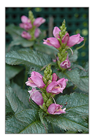
Hot Lips Turtlehead flowers

Hot Lips Turtlehead is recommended for the following landscape applications;