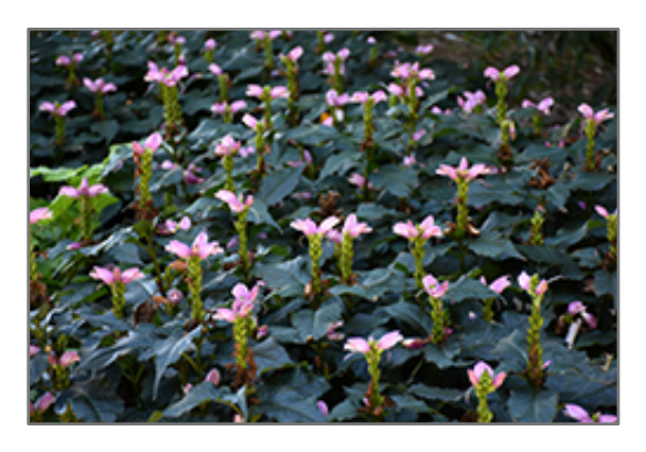
Hot Lips Turtlehead in bloom