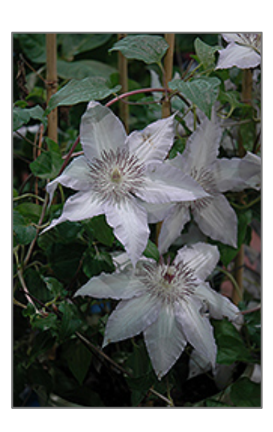
Claire De Lune Clematis flowers

Claire De Lune Clematis is covered in stunning white star-shaped flowers with lavender overtones and deep purple anthers at the ends of the branches from early summer to early fall. It has green deciduous foliage. The compound leaves do not develop any appreciable fall colour.