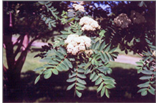
Showy Mountain Ash flowers

This tree should only be grown in full sunlight. It is very adaptable to both dry and moist locations, and should do just fine under average home landscape conditions. It is not particular as to soil type or pH. It is highly tolerant of urban pollution and will even thrive in inner city environments. This species is native to parts of North America.