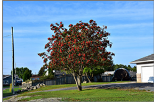
Showy Mountain Ash fruit