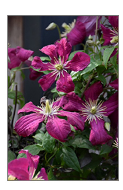
Madame Julia Correvon Clematis flowers

Madame Julia Correvon Clematis is covered in stunning red star-shaped flowers with yellow anthers at the ends of the branches from mid summer to early fall. It has green deciduous foliage. The compound leaves do not develop any appreciable fall colour.