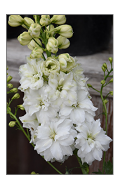
Green Twist Larkspur flowers

Magnificent display of double white flowers on towering spikes; flowers are beautifully dappled with scrumptious apple-green markings; good vertical form, dense flower spikes, strong stems; excellent uniformity