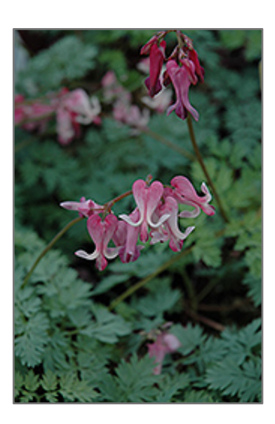
Candy Hearts Bleeding Heart flowers

Lacy blue-green foliage on a compact mound with delicate, rose-pink dangling heart-shaped flowers on nodding stems, like little jewels in the garden; likes moist, shady areas