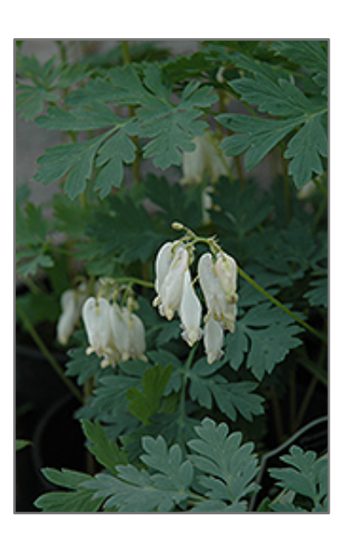
Aurora Bleeding Heart flowers

Lacy blue-green foliage on a compact mound with delicate, white dangling heart-shaped flowers on nodding stems, like little jewels in the garden; likes moist, shady areas