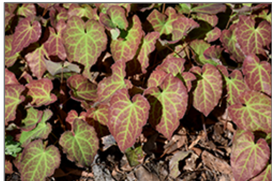
Froehnleiten Bishop's Hat foliage