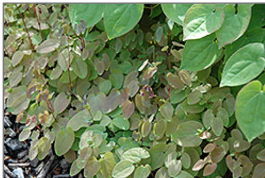
Pink Bishop's Hat foliage

Other Names: Barrenwort, Bishop's Hat, Fairy Wings