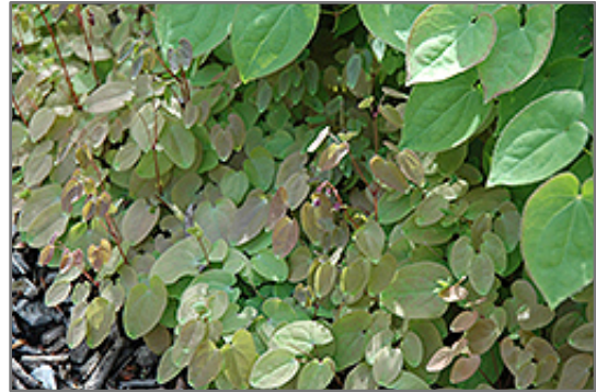
Pink Bishop's Hat foliage

Other Names: Barrenwort, Bishop's Hat, Fairy Wings