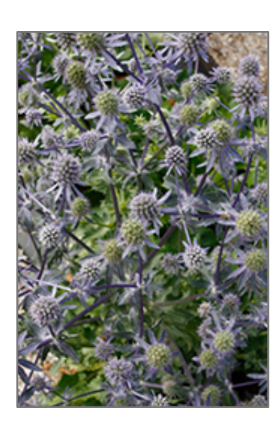
Blue Glitter Sea Holly flowers

Unusual and show-stopping prickly steel-blue flowers with darker blue stems, thistle-like; tolerates hot dry sites; attractive to butterflies; pair up with softer textured plants, beautiful in dried arrangements