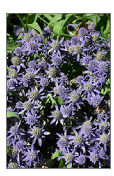
Blue Hobbit Sea Holly flowers

A most compact sea holly with unusual and show-stopping prickly steel-blue flowers with darker blue stems, thistle-like; tolerates hot dry sites; attractive to butterflies; pair up with softer textured plants, beautiful in dried arrangements